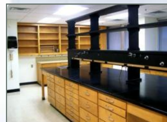
Renovated spaces of Pharmacology. (on the left) Space in the departmental administrative office was opened up by the removal of walls to combine two rooms into a more efficient layout. (on the right) Newly renovated lab once occupied by Dr. Louis Ignarro.