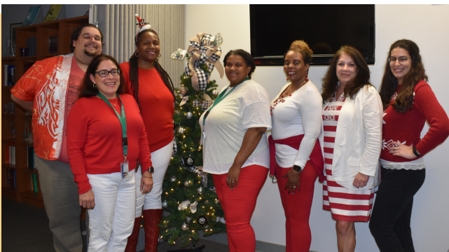
Psychiatry staff celebrate Holiday Spirit Week