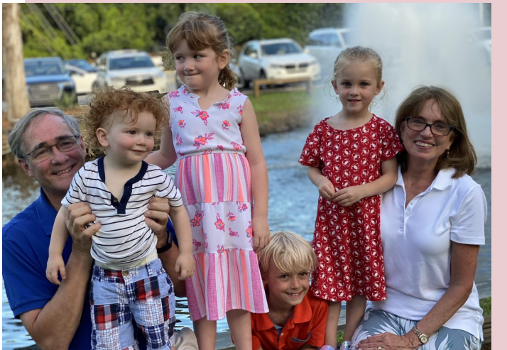
The Zeanahs enjoying some summertime self-care.