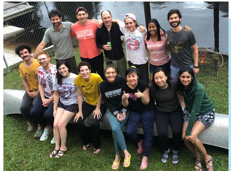
Tulane MedPsych 2021 retreat